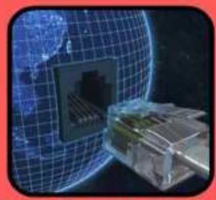
Others (IT. Logistics, Telecoms)