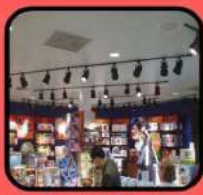
Commercial, Retail (FMCG) & Hospitality