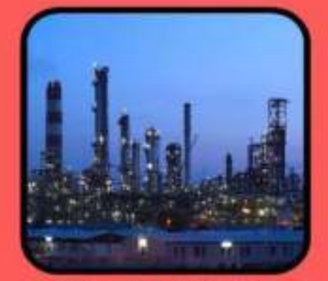
Oil, Gas & Petrochemicals (Off / Onshore)