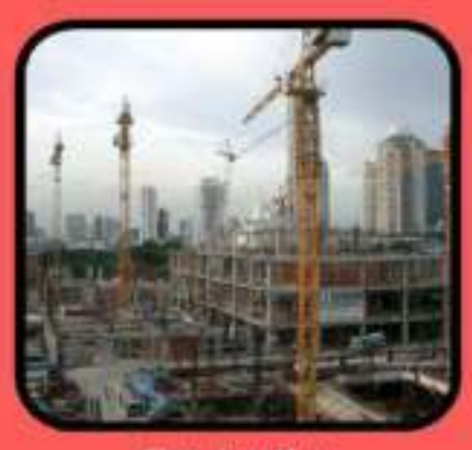
Construction & Maintenance